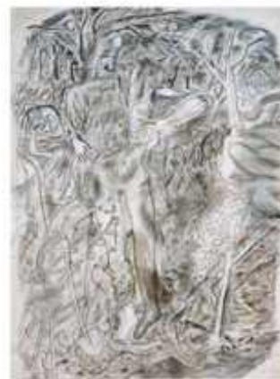
Requiem: The Great War