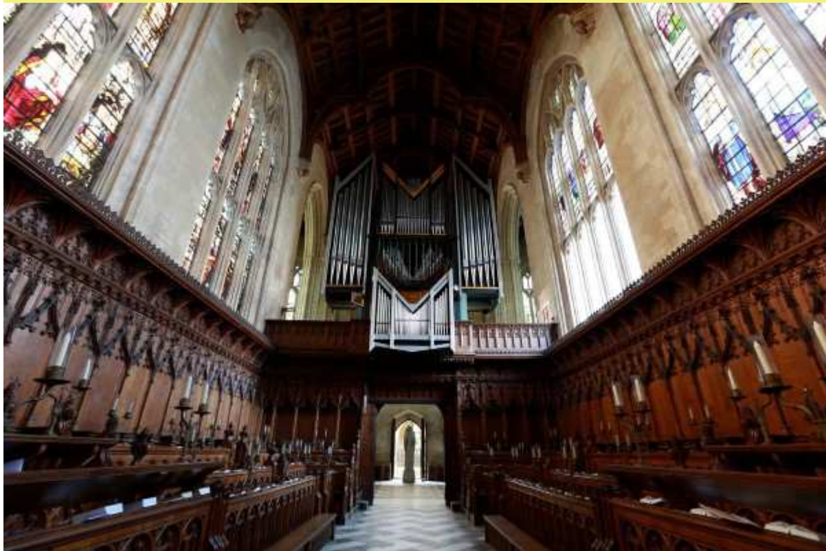
Ante-Chapel, New College, Oxford.

Welcome to our Spring 2015 Newsletter No. 7